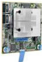
HPE Smart Array P408i-a SR Gen10 Ctrlr (804331- B21 & 869081-B21)

The HPE Smart Array SR Gen10 Controllers for the ProLiant DL and ML Gen10 Servers and Apollo Gen10 Servers, supporting 12Gb/s SAS and PCIe 3.0, are ideal for maximizing performance while supporting advanced RAID levels with up to 4 GB flash-backed write cache (FBWC). These controllers operate in Mixed Mode which combines RAID and HBA/JBOD operations simultaneously. The Smart Array SR Gen10 controller portfolio is able to support up to 24 internally attached drives on a single controller allowing connection to SAS or SATA drives without having to use the SAS Expander card. The Smart Array SR Gen10 Controllers also offer encryption for data-at-rest on any drive with HPE Smart Array SR Secure Encryption. The HPE Smart Array SR Gen10 controller portfolio provides enterprise-class storage performance, reliability, security and efficiency needed to address your evolving data storage needs.