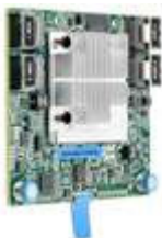
HPE Smart Array P816i-a SR Gen10 Ctrlr (804338- B21 & 869083-B21)