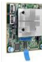
HPE Smart Array E208i-a SR Gen10 Ctrlr (804326- B21 & 869079-B21)