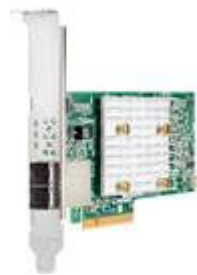
HPE Smart Array P408e-p SR Gen10 Ctrlr (804405- B21)