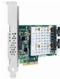
HPE Smart Array P408i-p SR Gen10 Ctrlr (830824- B21)