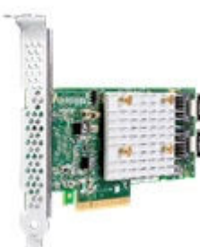
HPE Smart Array E208i-p SR Gen10 Ctrlr (804394- B21)