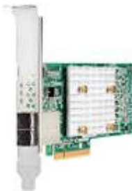
HPE Smart Array E208e-p SR Gen10 Ctrlr (804398- B21)